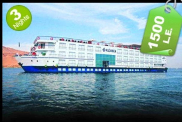
Al Kahila Nile Cruise