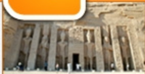
Abu simbel temples