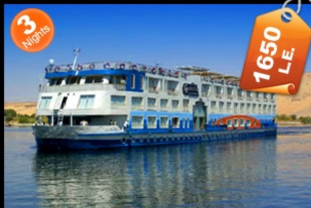
M/S Nile Vision Cruise

Al Kahila Nile Cruise gives you the opportunity to view the ancient monuments and temples of Luxor. Visit the Valley of the Kings, Karnak temple and discover a civilization that's over 5,000 years old.