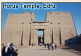
Horus Temple, Edfu